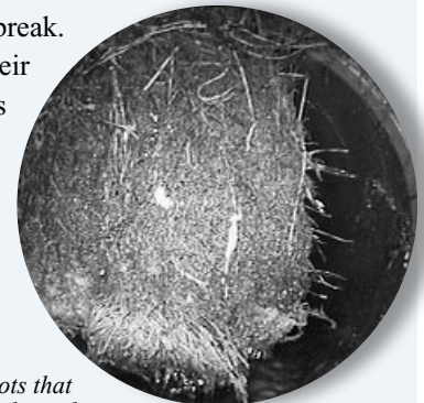
View of the inside of a sewer lateral clogged with roots that are growing through cracks in the lateral.

As soils settle and shift, sewer laterals can break. Sometimes, property owners crack open their laterals to insert outdoor drains. These cracks and breaks allow rainfall to infiltrate and overflow the treatment plants. Also, roots can enter through cracks and breaks on the lateral. Eventually large balls of roots build up and clog laterals, or come loose and clog main sewer pipelines.