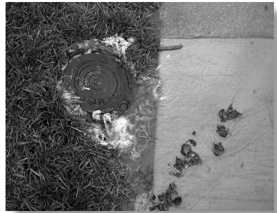
A failing sewer lateral can cause sewage to overflow onto the ground.

A faulty or broken lateral can cause sewage to back up into the house or overflow onto the ground or street and can ultimately end up in storm drains, creeks, and the Bay. Wastewater may also leak underground. In addition, during rain storms, a great deal of water reaches the District's