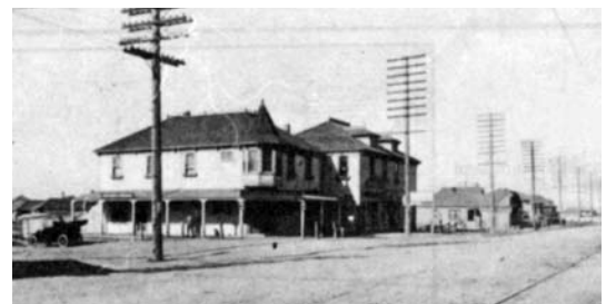
Stege junction in 1913

On May 15, 2013, Stege Sanitary District will celebrate 100 years of service to the communities of El Cerrito, Kensington, and Richmond Annex. To get ready for this historical event, Stege is compiling a history of the District. Do you have any anecdotes or memories of the District you would like to share? Do you have photographs or news clippings that help tell the story of Stege? If so, the District would love to hear from you. Either write to 7500 Schmidt Lane, El Cerrito, CA 94530-0537 or email Staff@StegeSD.dst.ca.us .